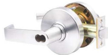
IC CORE OPTION (Core not included)